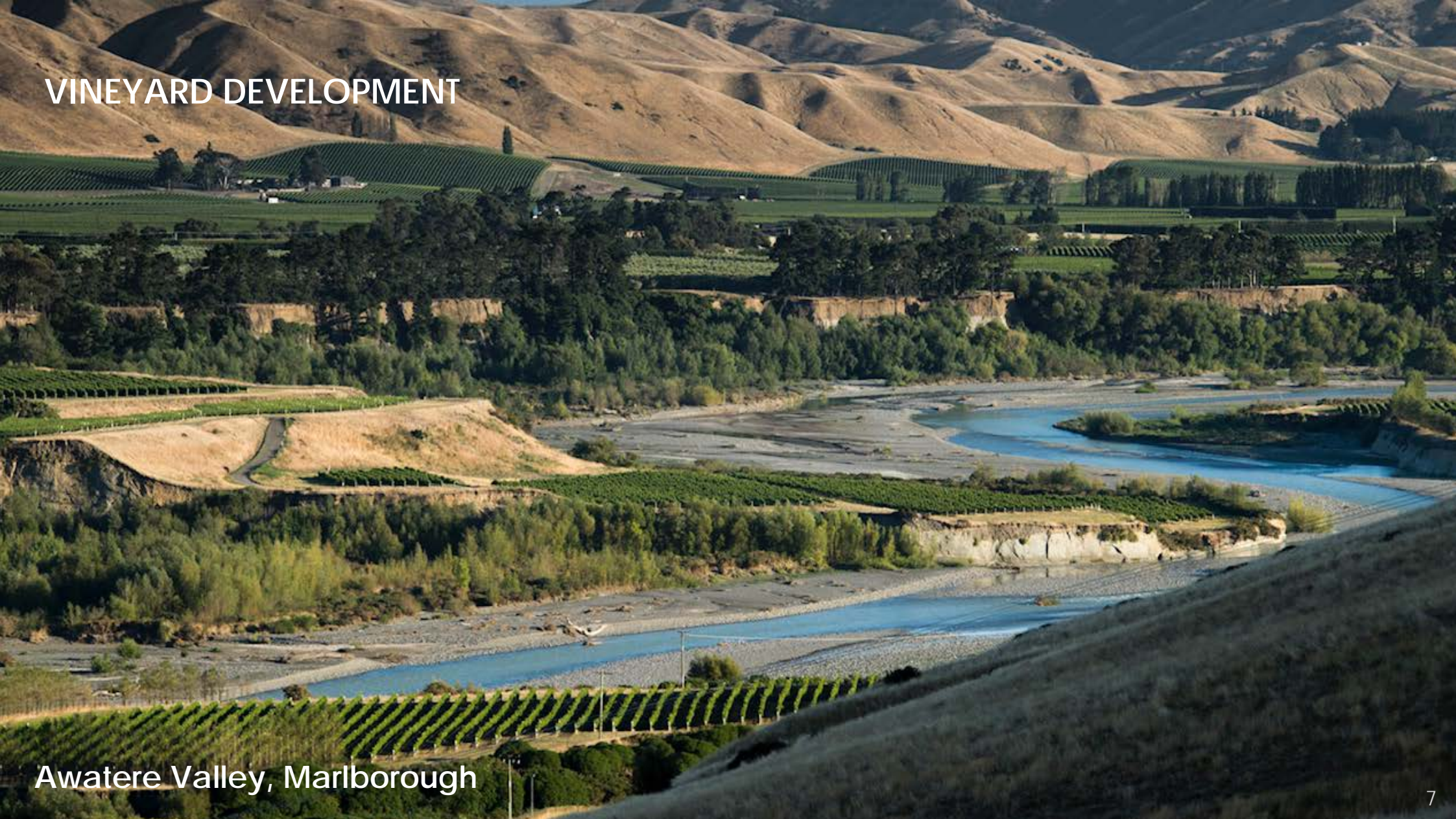
Awatere Valley, Marlborough