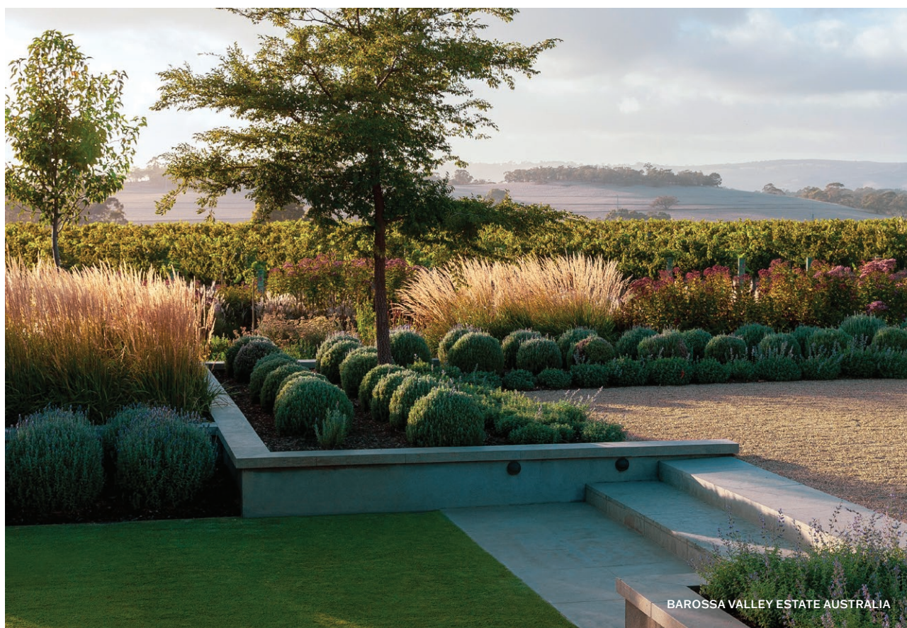
BAROSSA VALLEY ESTATE AUSTRALIA